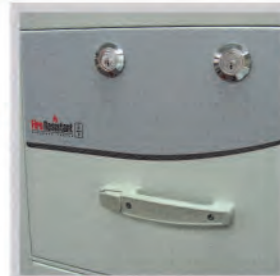
Dual Key Lock