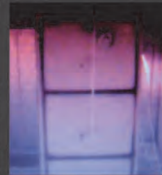
Actual Burning of Test Object