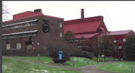
SP Technical Research Institute of Sweden