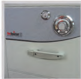
Key Lock & Combination