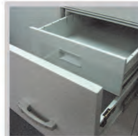
Twin Deck Drawer