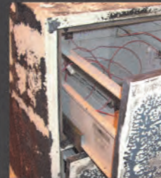
After Test (180mins), plastic sticker still intact