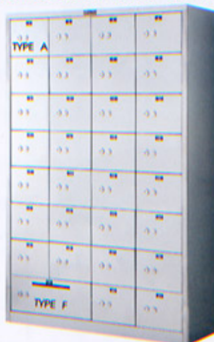
MODEL SDL-31 (NEW) H1,380/W895/D300 mm

Hingeless covered with stainless steel door and frame