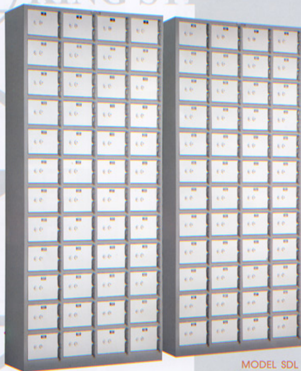
MODEL SDL 48 H2,040/W895/D300 mm

The complete series for your guests to appreciate how it can entrust their valuables