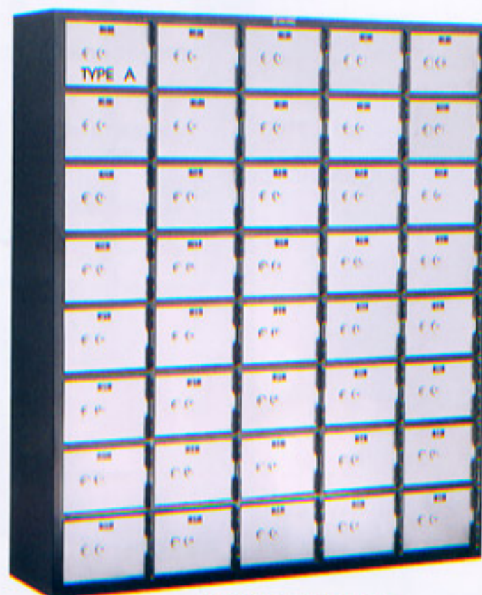
MODEL SDL-40 H1,380/W1,110/D300 mm

King Steel Locks are designed with quality as a priority. Their inter-changeable features allow flexible means of replacing locks of vacated lockers.