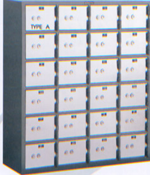
MODEL SDL-24 H1,050/W895/D300 mm