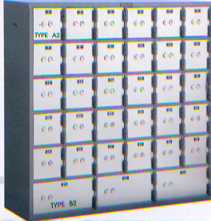
MODEL SDL-33 H1,050/W1,025/D300 mm

For almost half decade, KING STEEL Safe Deposit Locker Cabinets have been widely accepted by hospitality customers with over thousands units throughout the country as well as neighbouring countries. They are manufactured in a well-equipped plant, designed to the most stringent specifications, and customized to best suit each customer's requirements.